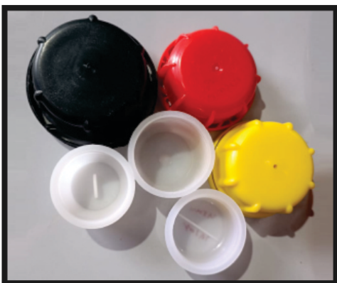
INNER & OUTER CAP 2"