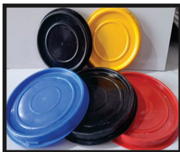
10" & 14" F.O.T DRUM CAPS