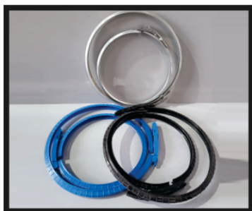
METAL & PLASTIC RING